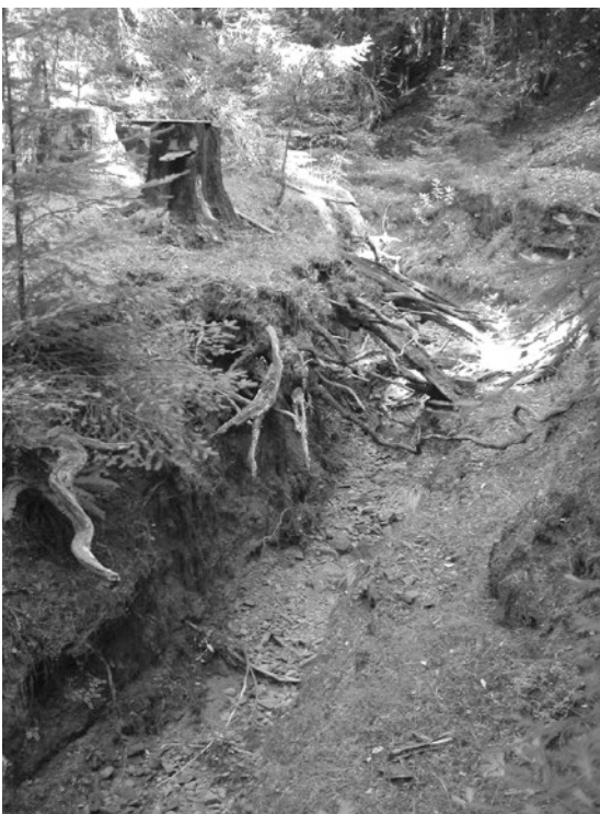
Erosion on Tony Creek