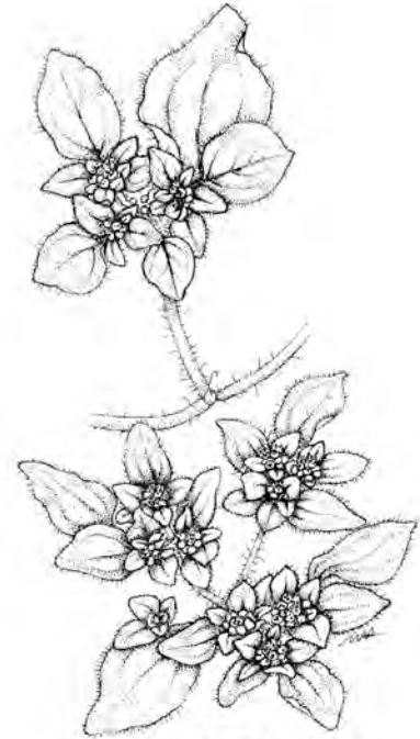
Drawing by Mimi Kamp