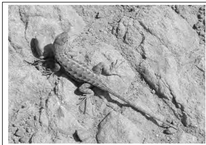
Western Fence Lizard

Please contact Anderson Valley Land Trust at 895-3150 or visit our website at www.andersonvalleylandtrust.org .