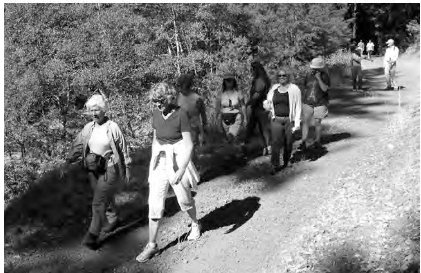
Navarro Trail Hike, September 28th