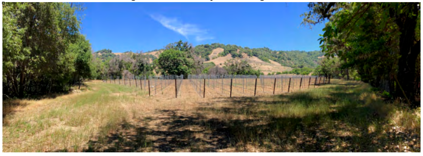
"Foremost in my mind is preserving the bucolic, unspoiled beauty of the area." Dario Sattui

Our most recent donation of a conservation easement from Dario Sattui covers four properties totaling 77.5 acres located in the heart of Anderson Valley. This easement is primarily an agricultural easement restricting most other land uses including a winery and tasting room. A key feature of the easement is that the four properties may not be sold separately thus keeping a scale and integrity that will support agriculture over time. Anyone in farming knows it is all about the soil and this property has been designated by the State as containing prime and unique farmland soils that support high-value crops. Dario will use Best Management Practices as recommended by the U.S. Natural Resources Conservation Service to keep the soil healthy and prevent erosion and maximize its biodiversity.