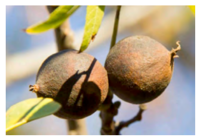
Juglans hindsii Northern California Black Walnut

It has certainly been an unusual past two years...and Covid is proving a very tough nut to crack. Using that segue, our featured plant also produces a very tough nut to crack: Juglans hindsii, the Northern California black walnut. Just leafing out at this time of year, its fresh green foliage contrasts with its dark and deeply furrowed bark. It is a large deciduous tree that occurs throughout California, though this species is more abundant in the northern part of the state while its cousin Juglans californica occupies the southern regions. It favors areas along water courses (for those of you familiar with the California's East Bay, think Walnut Creek), but can survive considerable dryness under cultivation. During the active growing season, the tree sports long feathery leaves of many pointed bright green leaflets; the spring flowers are long hanging catkins, greenish in color, not showy but noticeable. It can become a large majestic tree, reaching heights of up to 70 feet. It serves well as a stately shade tree, but the fruit drop can be messy. The nuts, while certainly edible, take some work to get to that point. The outer husk (that surrounds the familiar shell) is fuzzy and when cracked open (not easy!) leaves a blackish residue on the hands that is hard to remove. The nuts have a stronger flavor than the far more commercially popular English walnut (Juglans regia).