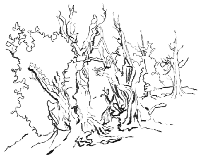
drawing by Patrick Miller

These amazing trees are the ultimate poster oldsters for weathering adversity. Growing at elevations typically from 10,000 - 11,500 feet, bristlecone pines tolerate thin soils, scant rainfall, strong winds, cold temperatures and generally inhospitable conditions perhaps in part because they have little competition. Other plants just don't bother.