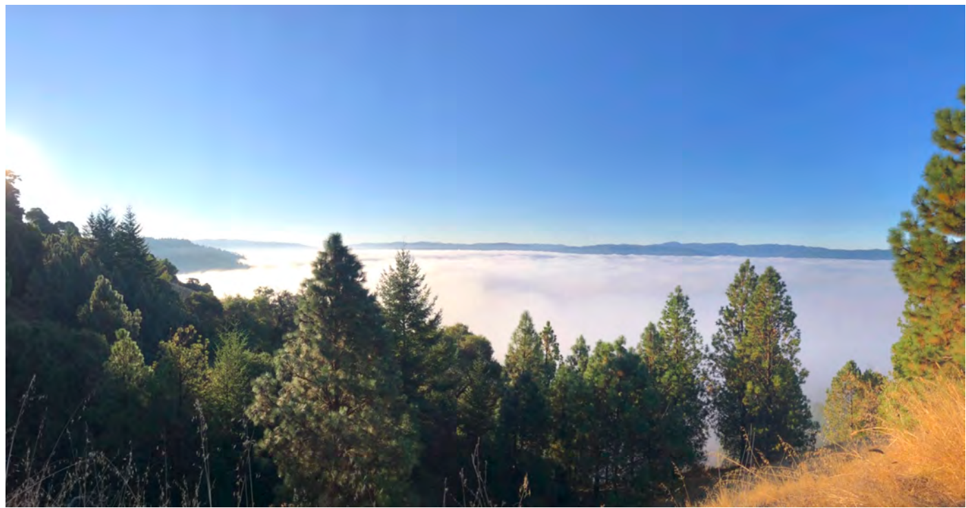
© View from Clow Ridge looking upstream toward Boonville.

The Mendocino County Sustainable Agricultural Lands Committee (SALC) has been busy planning four free workshops for farm and ranchland owners centered on the benefits of the Williamson Act and conservation easements in January and February. The workshops are focused on both the current viability of working lands and the legacy of transferring them intact to the next generation. The workshops will be offered online or by telephone. Technical assistance will be available. Full workshop information will be posted at <a href="https://mcrcd.org/project/mendocino-county-sustainable-agricultural-lands-strategy-program">https://mcrcd.org/project/mendocino-county-sustainable-agricultural-lands-strategy-program</a> and <a href="https://www.andersonvalleylandtrust.org">www.andersonvalleylandtrust.org</a> or call the AVLT office at 895-3150.