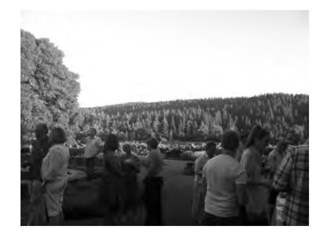
The scenic view at Goldeneye Winery