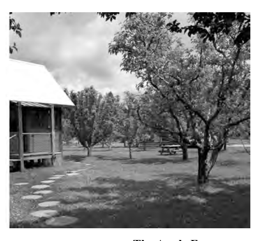
The Apple Farm

It is again time to discover, or perhaps to rediscover, what a dynamic place Anderson Valley is and how in the middle of summer the Valley's picturesque landscape produces sustenance that feeds not only our bodies but our souls. Our one-day Sustainable Landscape Discovery event will demonstrate how soils, water, microclimate, wildlife timing, management, cloning, hybridizing, procurement, recycling, and experimentation all are included