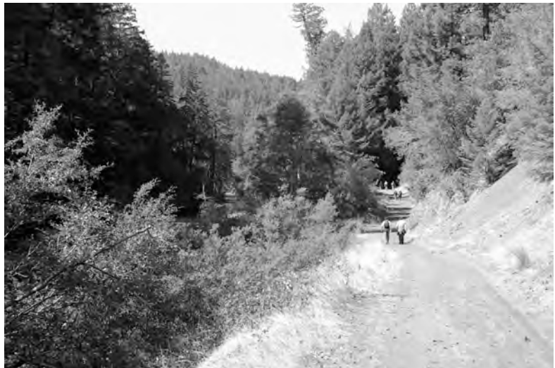
AVLT fall walk along the Navarro River

If you would like to walk with us, please email AVLT at avlt@mcn.org or call 895-3150 for more information, directions, or carpooling details. There is no fee.