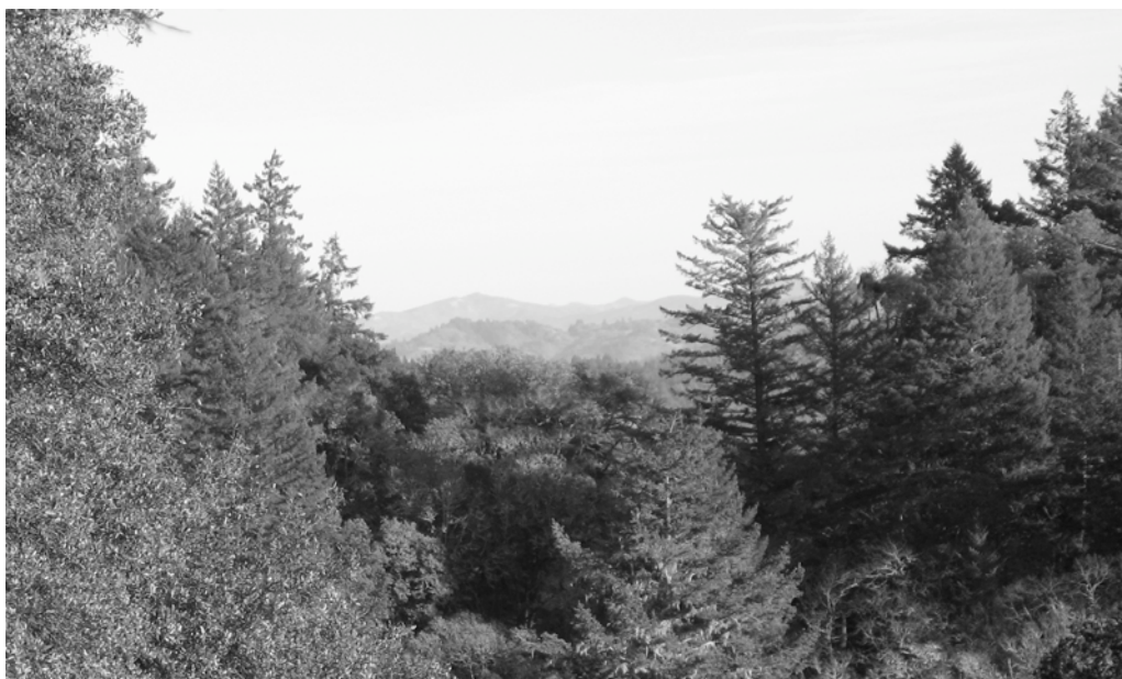
View of Mount St. Helena from the Snyder property

Steve and Janet knew they wanted, most of all, to protect the forest from severe logging. So one of the principle features of the easement is a set of performance goals and specific protection measures that will allow timber management that improves the forest while avoiding harm to the landscape and wildlife habitat. The forestry plan maintains the property's Timber Production Zone status, keeping taxes reasonable. The water in the seasonal streams will be left to flow downstream into Rancheria Creek.