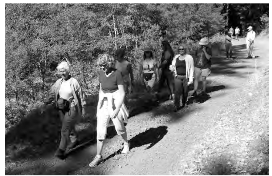
Navarro Trail Hike, September 28th