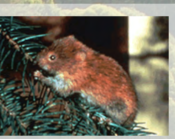
California red tree vole Arborimus pomo